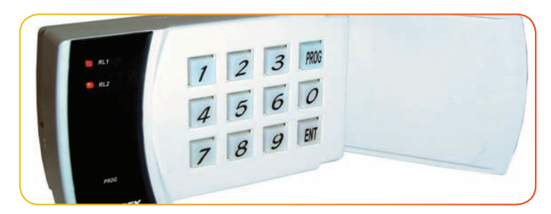
STANDARD PROXIMITY CARDS