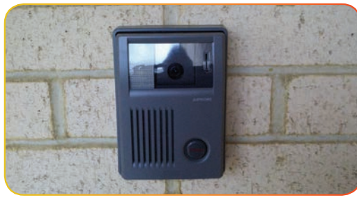
AUDIO / VIDEO DOOR ENTRY SYSTEM