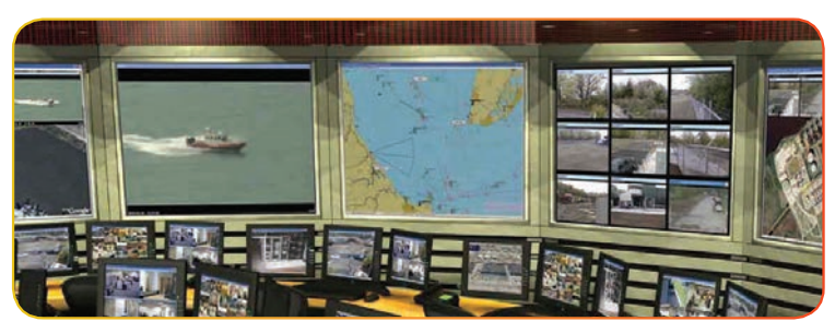
VIDEO MANAGEMENT SYSTEM